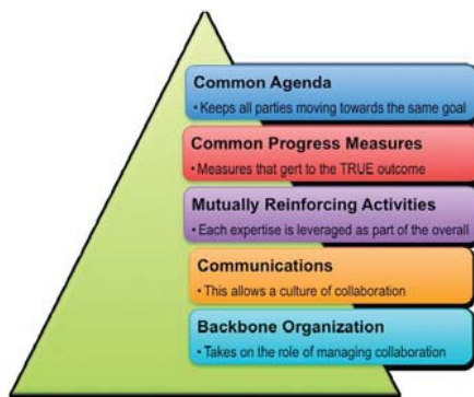
Collective Impact Framework

Continuity of Operations (COOP) Plan For Winnebago County Health Department October 26, 2016